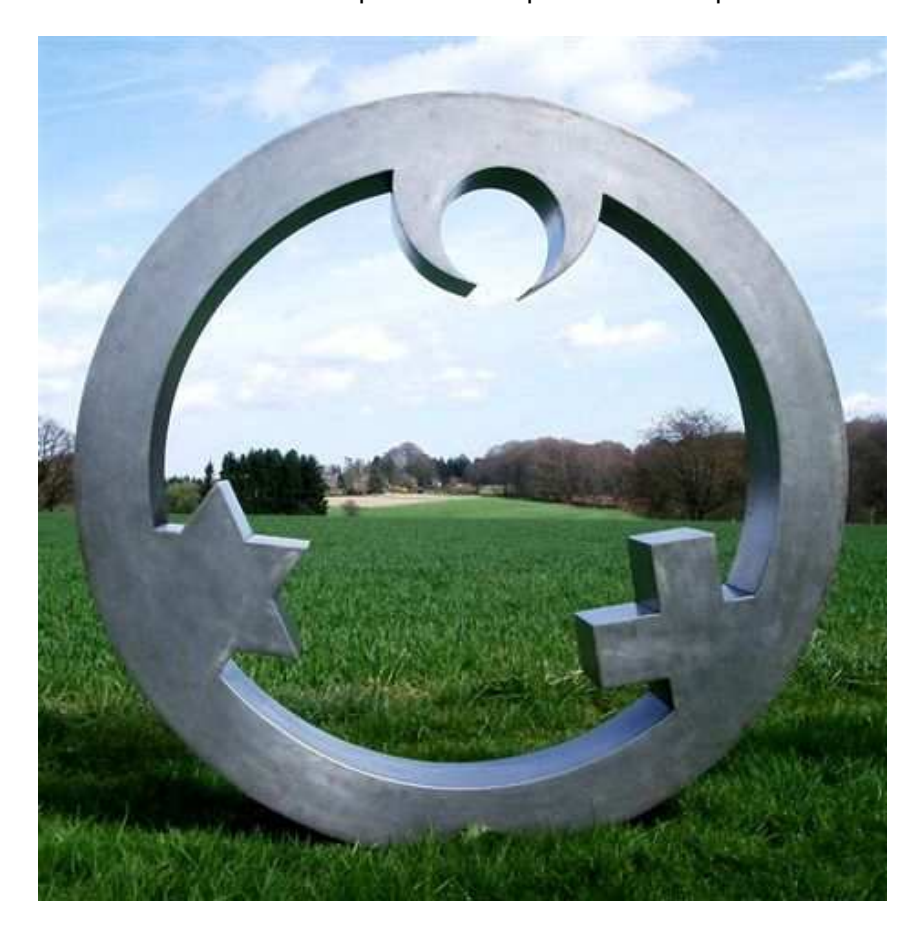
Ruhr.2010, Pécs.2010, Istanbul.2010 from 3 May to 31 May 2010

Art event within the scope of the European Culture Capitals 2010